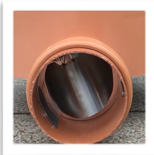
Not like this.

Ensure the Ratflap is perpendicular in the pipe.